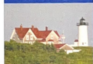
Lighthouse overlooking Vineyard Sound