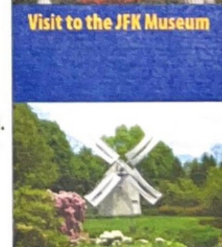
One of Cape Cod's many Windmills

Departure: Dearborn Adult Center, 311 W Tate St, Lawrenceburg, IN @ 8 am