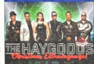
THE HAYGOODS CHRISTMAS SHOW

Departure: Dearborn Adult Center, 311 W Tate St, Lawrenceburg, IN @ 8 am