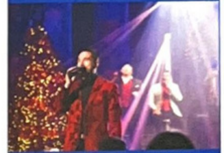
HUGHES BROTHERS CHRISTMAS SHOW