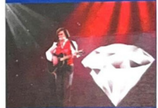
A NEIL DIAMOND TRIBUTE SHOW